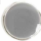
PEWTER CAST Pantone P174-3 U

Formula: 1 tsp Nunn Design Resin 1 toothpick tip Blue 2 toothpick tips Red 2 toothpick tips White