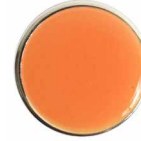
TURMERIC 3 Pantone 15-1264

Formula: 1 tsp Nunn Design Resin 2 large toothpicks Yellow 1 tiny toothpick tip Red