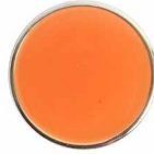
TURMERIC 1 Pantone 15-1264

Formula: 1 tsp Nunn Design Resin 2 large toothpicks Yellow 1 tiny toothpick tip Red