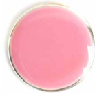
PINK ICING Pantone 15-1717 TPX

Formula: 1 tsp Nunn Design Resin 2 toothpick tips White 3 tiny toothpick tips Red