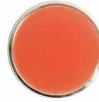
LIVING CORAL 2 Pantone 16-1546