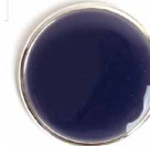
EGGPLANT Pantone 2695 CP

Formula: 1 tsp Nunn Design Resin 1 tiny toothpick tip Blue 2 toothpick tips White 1 tiny toothpick tip Yellow