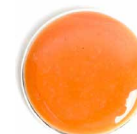
TANGERINE Pantone 15-1247 TPX

Formula: 1 tsp Nunn Design Resin 1 tiny toothpick tip Blue 1 toothpick tip Red 2 toothpick tips White