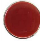
JESTER RED 3 Pantone 19-1862