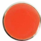
FIESTA 3 Pantone 17-1564

Formula: 1 tsp Nunn Design Resin 2 large toothpicks Yellow 2 large toothpicks Red