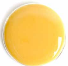
MIMOSA Pantone 15-1247 TPX

Formula: 1 tsp Nunn Design Resin 1 tiny toothpick tip Red 1 toothpick tip White 2 toothpick tips Yellow