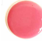
CORAL Pantone 2346 U

Formula: 1 tsp Nunn Design Resin 2 toothpick tips Black 2 toothpick tips White