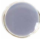
LILAC GRAY Pantone 16-3905 TCX

Formula: 1 tsp Nunn Design Resin 1 tiny toothpick tip Blue 1 toothpick tip Yellow 2 toothpick tips White 2 toothpick tips Black