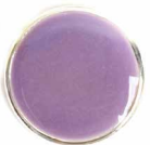
LAVENDER HERB Pantone 16-3310 TPX

Formula: 1 tsp Nunn Design Resin 1 toothpick tip Yellow 1 very tiny toothpick tip Blue 1 toothpick tip White 1 tiny toothpick tip Brown