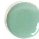
SILT GREEN Pantone 14-5706 TPX

Formula: 1 tsp Nunn Design Resin 2 toothpick tips White 3 tiny toothpick tips Red