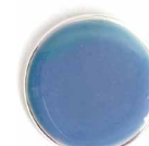
SERENITY Pantone 15-3919 TCX

Formula: 1 tsp Nunn Design Resin 3 toothpick tips White 3 toothpick tips Yellow 1 tiny toothpick tip Red 1 tiny toothpick tip Brown