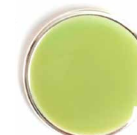
CELERY GREEN Pantone 13-0532 TPX

Formula: 1 tsp Nunn Design Resin 2 toothpick tips Black 1 tiny toothpick tip Black 3 toothpick tips White 1 tiny toothpick tip Blue 1 tiny toothpick tip Red