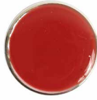
JESTER RED 1 Pantone 19-1862