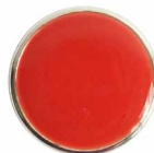
FIESTA 1 Pantone 17-1564

Formula: 1 tsp Nunn Design Resin 3 large toothpicks Red 1 tiny toothpick tip Yellow 1 tiny toothpick tip Blue