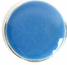
BLUE Pantone 2171 U

Formula: 1 tsp Nunn Design Resin 1 tiny toothpick tip Blue 2 toothpick tips White 1 tiny toothpick tip Yellow