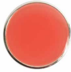
LIVING CORAL 1 Pantone 16-1546