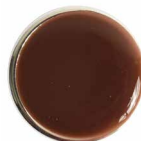
TOFFEE 1 Pantone 18-1031

Formula: 1 tsp Nunn Design Resin 1 large toothpick Blue 2 large toothpicks Black