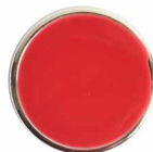
FIESTA 2 Pantone 17-1564

Formula: 1 tsp Nunn Design Resin 2 large toothpicks Yellow 1 large toothpick Red