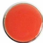
FIESTA 4 Pantone 17-1564

Formula: 1 tsp Nunn Design Resin 2 large toothpicks Yellow 1 tiny toothpick tip Red