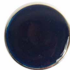
ECLIPSE 1 Pantone 19-3810

Formula: 1 tsp Nunn Design Resin 2 large toothpicks Yellow 1 tiny toothpick tip Red 1 tiny toothpick tip White