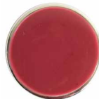
PINK PEACOCK 1 Pantone 18-2045

Formula: 1 tsp Nunn Design Resin 2 large toothpicks Brown 1 tiny toothpick tip White