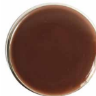
TOFFEE 2 Pantone 18-1031

Formula: 1 tsp Nunn Design Resin 2 large toothpicks Brown