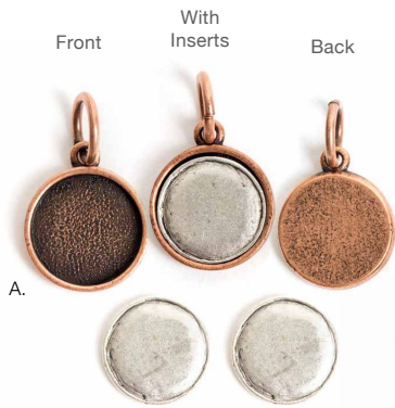
A. KIT EMBROIDERY MINI CIRCLE 3PK ( kwemc3 ) 14.7mm Bezel Diameter 12.2mm Tag Insert Diameter