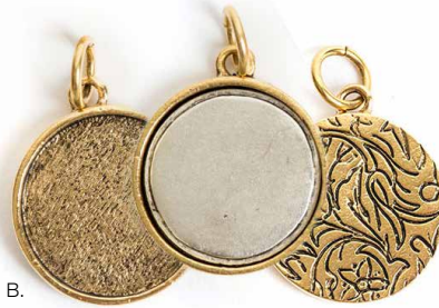
B. KIT EMBROIDERY LARGE CIRCLE 3PK ( kwelc3 ) 23mm Bezel Diameter 20.9mm Tag Insert Diameter