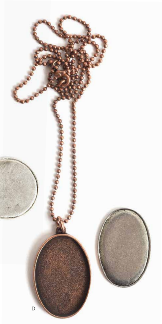
D. KIT EMBROIDERY NECKLACE GRANDE CIRCLE (kwengc) 34mm Bezel Diameter 31.1mm Tag Insert Diameter 24" Necklace