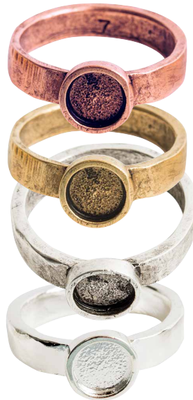
rhic7-cb • rhic7-gb • rhic7-sb • rhic7-ssb

pack of 10 OD: Band width 4mm, Bezel 8 x 8 x 2mm ID: Ring size 6, Bezel 6.5 x 6.5 x 1.5mm