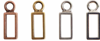
ofirs-cb • ofirs-gb • ofirs-sb • ofirs-ssb