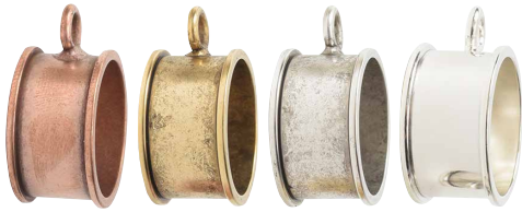
obcdscs-cb • obcdscs-gb • obcdscs-sb

pack of 10 OD: 31 x 12.8 x 2.9mm ID: 22.9 x 10.1 x 2.9mm Hole Size: 3.2mm