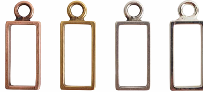
ofrs-cb • ofrs-gb • ofrs-sb • ofrs-ssb

pack of 10 OD: 18.4 x 6.4 x 2.8mm ID: 10.6 x 4.3 x 2.8mm Hole Size: 3.2mm