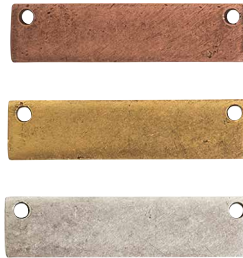
ftsrh-cb • ftsrh-gb • ftsrh-sb