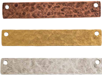
hftlnh-cb • hftlnh-gb • hftlnh-sb