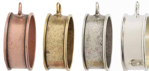
obcdlcs-cb • obcdlcs-gb • obcdlcs-sb

pack of 5 OD: 22.5 x 17 x 9.4mm ID: Bezel 14.8 x 14.8 x 9.4mm, Channel 7.7mm width x 1mm depth Hole Size: 3mm