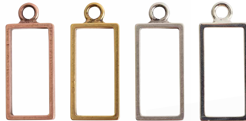
oflrs-cb • oflrs-gb • oflrs-sb • oflrs-ssb

pack of 10 OD: 24.6 x 9.5 x 2.9mm ID: 17 x 7.5 x 2.9mm Hole Size: 3.2mm