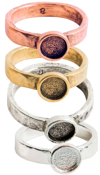
rhic8-cb • rhic8-gb • rhic8-sb • rhic8-ssb

pack of 10 OD: Band width 4mm, Bezel 8 x 8 x 2mm ID: Ring size 7, Bezel 6.5 x 6.5 x 1.5mm