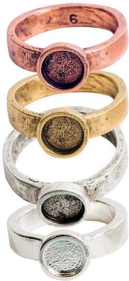
rhic6-cb • rhic6-gb • rhic6-sb • rhic6-ssb

pack of 10 OD: 12.7 x 9.1 x 2.1mm Hole Size: 2mm